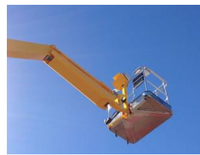
Flush basket mount