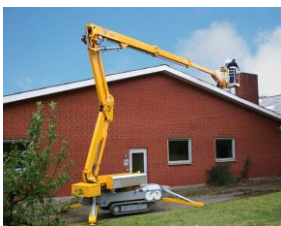
Up and over